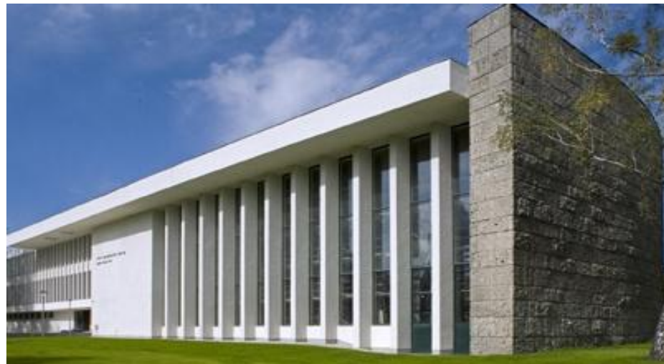
Henry Ford Building