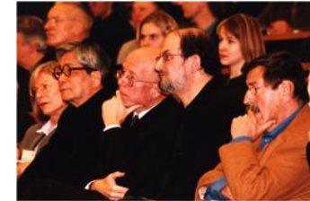
Kenzaburo Oe, Salman Rushdie, Günter Grass