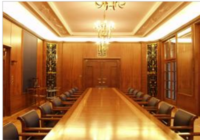
“Golden Room” of Präsidium