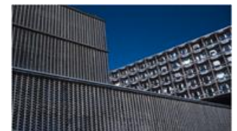
Charité, Benjamin Franklin Campus