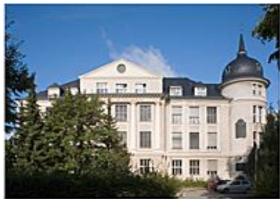
Otto Hahn-Lise Meitner Building