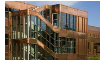
Habelschwerdter Allee 45