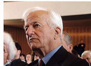
Richard von Weizsäcker