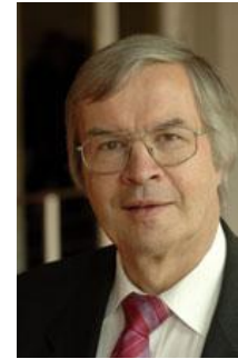
Theodor W. Hänsch